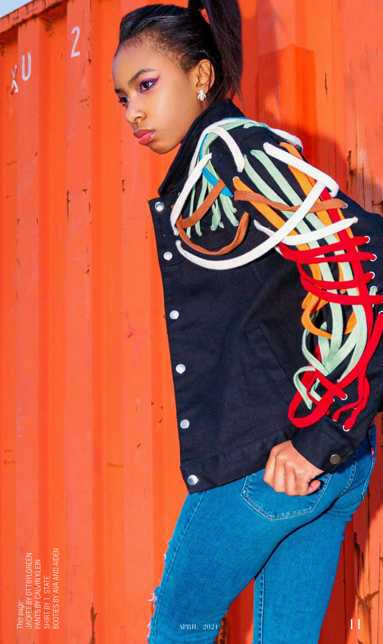
This page: JACKET BY DTTBYLGREEN PANTS BY CALVIN KLEIN SHIRT BY 1. STATE BOOTIES BY AVA AND AIDEN