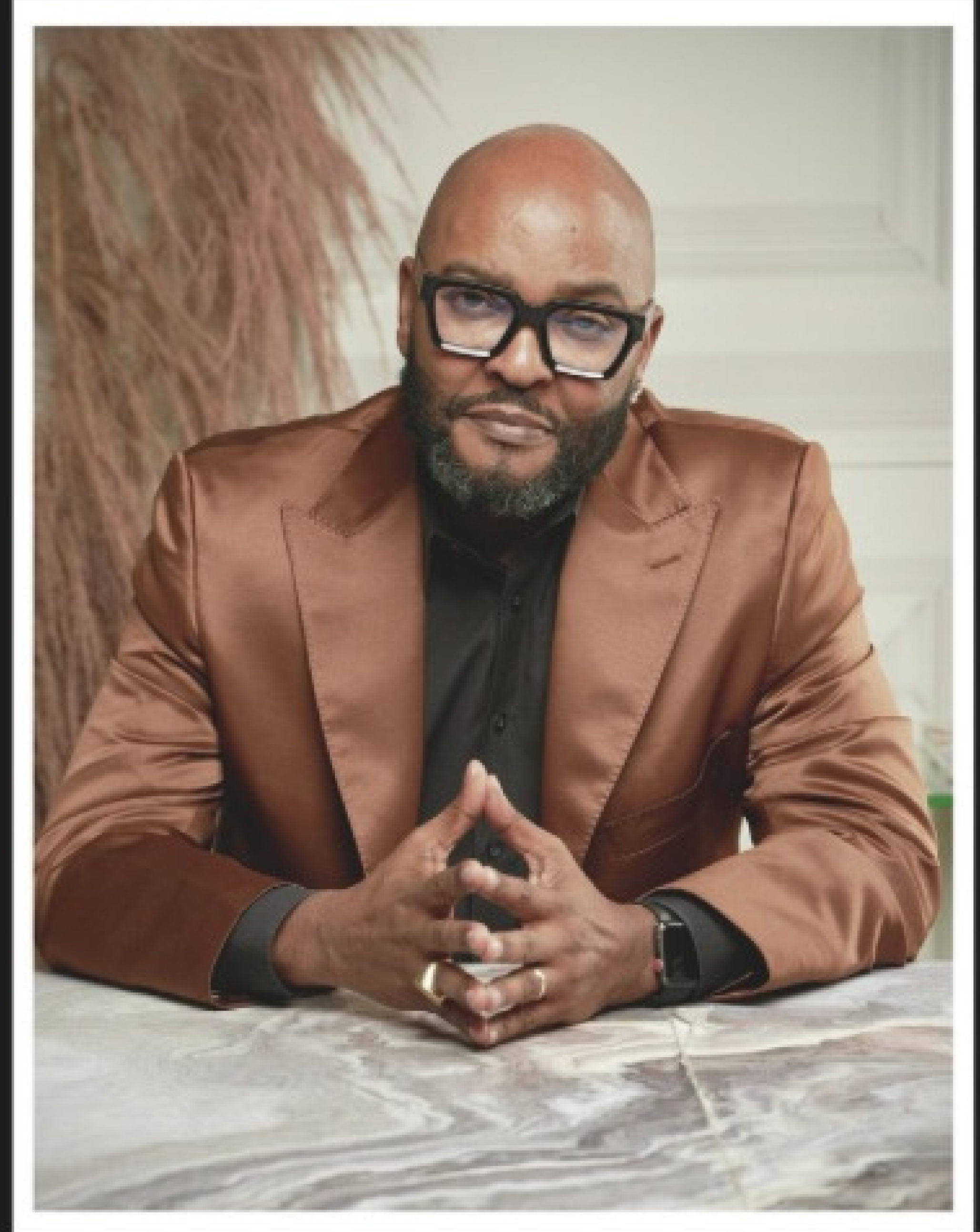
LAVISH BEAUTY AND HAIR BY PHOTOGRAHY